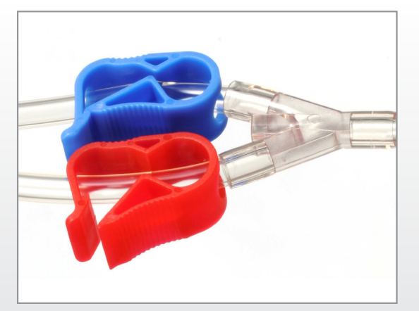
Colour coded clamps help to identify the bag that is been drained