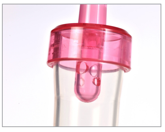
Bubbles and fogging are eliminated by perforations in the dispersing tube that flow evenly along the walls, while maintaining a good flow rate.