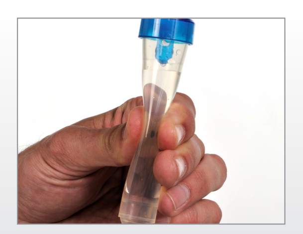
The softer drip chamber is easier to squeeze even if irrigating fluid is cold.