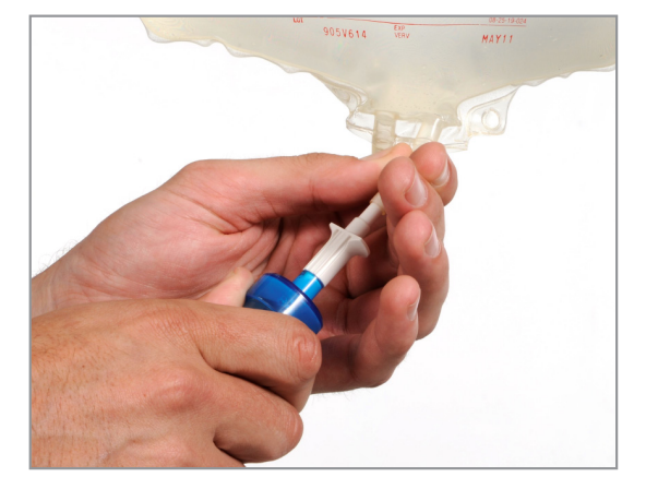
The Spike is attached directly to the drip chamber making piercing of the bag easier.

The entire set is made of DEHP-free material to reduce the impact of disposal on the environment.