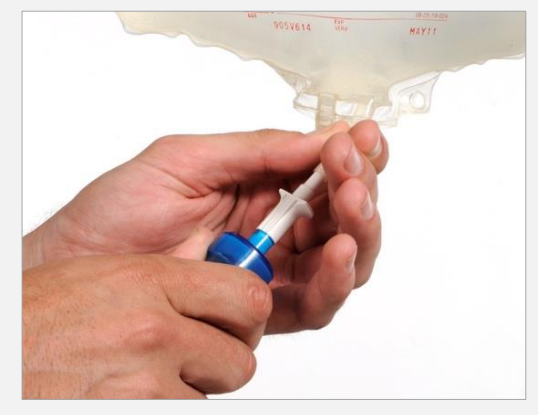
The Spike is attached directly to the drip chamber making piercing of the bag easier

The entire set is made of DEHP-free material to reduce the impact of disposal on the environment.