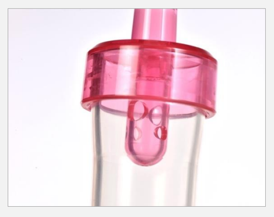
Bubbles and fogging are eliminated by perforations in the inner dispersing tube that flow evenly along the walls, while maintaining a good flow rate