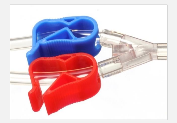
Colour coded clamps help to identify the bag that is being drained