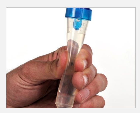
The softer drip chamber is easier to squeeze even if irrigating fluid is cold